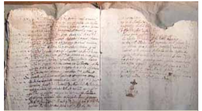
The document which records the sworn and written testimony of those witnesses who were present at the apparition