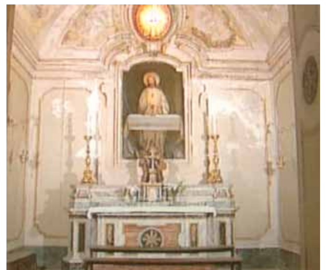
The chapel where the apparition occurred

At Easter in 1570 in the Church of St. Erasmus, the consecrated Host, according to the traditional rite at the time, was placed in a round silver container (pyx) and placed in a burse-like holder. This was later placed in a large, ceremonial silver chalice with its paten; the whole wrapped in an elegant silk cloth.