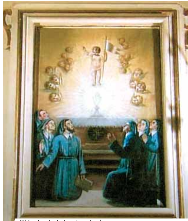
Old print depicting the miracle

During Easter of 1570 in the Church of St. Erasmus in Veroli, the Blessed Sacrament was exposed (at the time, the Blessed Sacrament was first placed in a round pyx and then placed in a large chalice, covered with a paten) for the Forty Hours of public adoration. The Child Jesus appeared in the exposed Host and manifested many graces. Today, the chalice where the Blessed Sacrament was exposed is kept in the same Church of St. Erasmus and is used once a year at the celebration of Mass on Easter Tuesday.