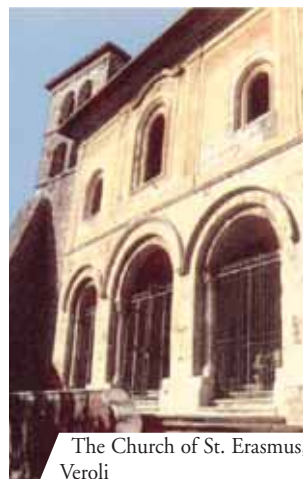
The Church of St. Erasmus, Veroli