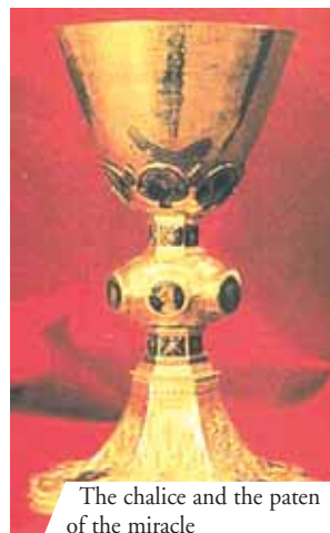
The chalice and the paten of the miracle