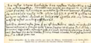
Text of the notation written by John Ribera in which he certifies that "till now the Holy Chalice is preserved in our Cathedral"