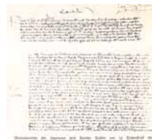
Document regarding the reception of the Holy Chalice in the Cathedral of Valencia in 1437