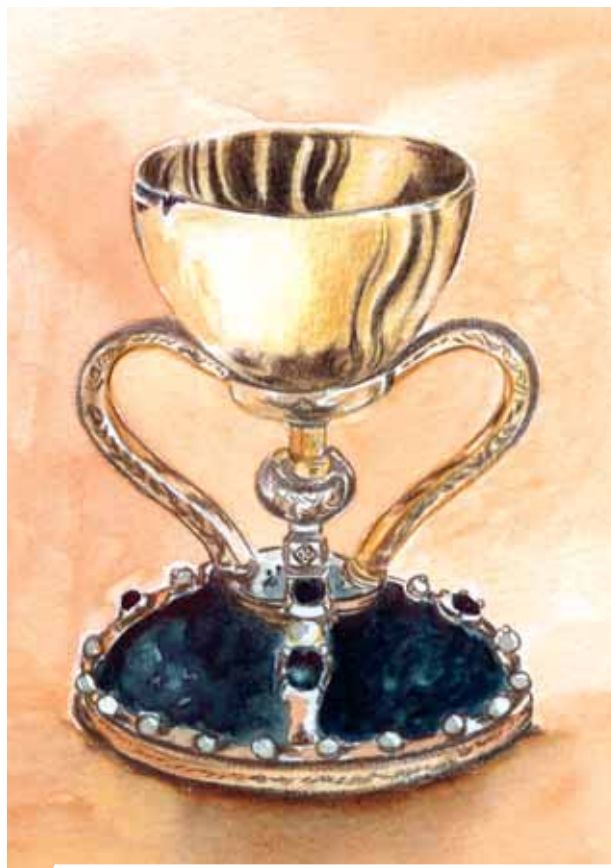
The Holy Chalice of Valencia

This precious object has always been at the center of extraordinary stories and novels like the legend of the Knights of the Round Table in England, the stories of Perceval in France, and Parzival in Germany of the twelfth and thirteenth century. This genre was used by Wagner in a Christian-esoteric perspective and at the end of the twentieth century the fantastic novels of B. Cornwell favored the birth of the editorial trend still alive today.