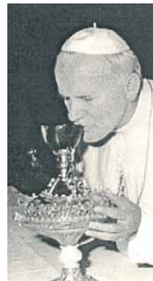
John Paul II kisses the Holy Grail of Valencia