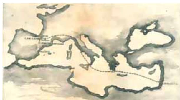
Route traveled by the Holy Chalice