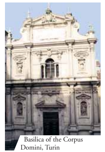
Basilica of the Corpus Domini, Turin