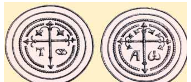
Imprints of the Host of the miracle