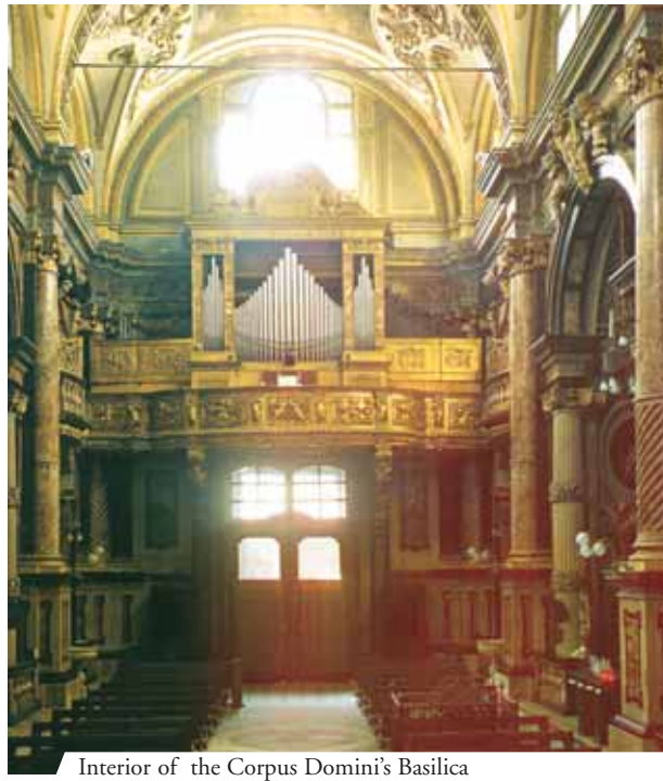
Interior of the Corpus Domini's Basilica

Inside the Corpus Domini Basilica in Turin, there is an iron railing that closes in the place where, in 1453, the first Eucharistic miracle of Turin occurred. An inscription inside the railing describes the miracle: “Here the she-mule that was carrying the Divine Body fell prostrate; here the Sacred Host was miraculously freed from the bag containing the Sacred Species and rose high; here came gently down among the suppliant hands of the people of Turin; here then, the place made holy by the miracle. Remembering, pray on your knees. (June 6, 1453)”.