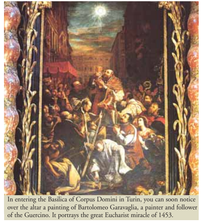
In entering the Basilica of Corpus Domini in Turin, you can soon notice over the altar a painting of Bartolomeo Garavaglia, a painter and follower of the Guercino. It portrays the great Eucharist miracle of 1453.