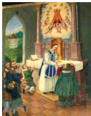
Painting of the Miracle of Seefeld, preserved in the Elsbethenkapelle ad Hopfgarten