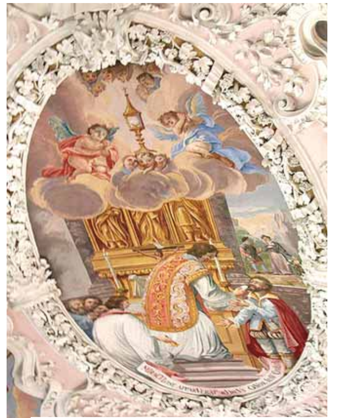
Miracle of Seefeld. Detail of the ceiling