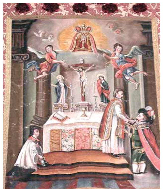
Banner in the Church of St. Oswald depicting the scene of the miracle