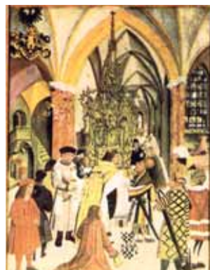
Ancient painting of the miracle