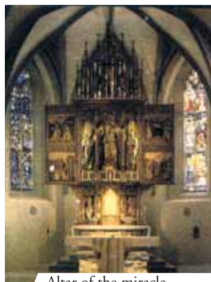
Altar of the miracle