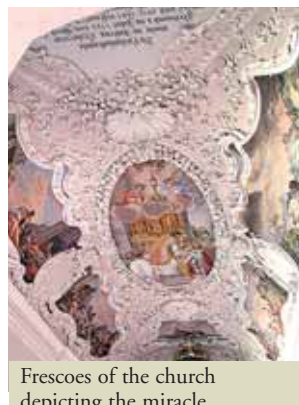
Frescoes of the church depicting the miracle