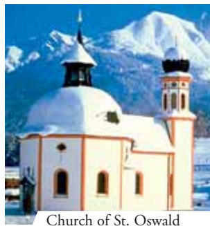
Church of St. Oswald