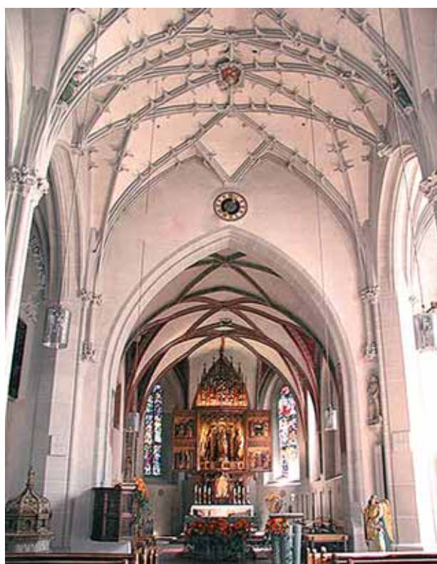
Main altar of the Church of St. Oswald, Seefeld