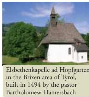
Elsbethenkapelle ad Hopfgarten in the Brixen area of Tyrol, built in 1494 by the pastor Bartholomew Hamersbach