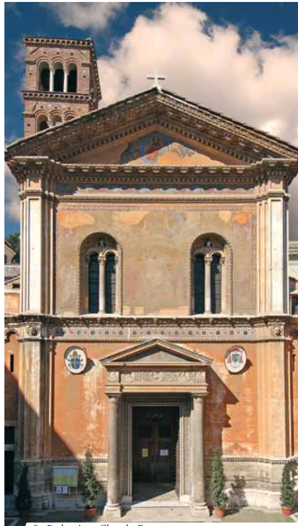
St. Pudenziana Church, Rome

It is still possible today to see the miraculous imprint left by the Host which fell on the steps of the altar in the Caetani Chapel of Santa Pudenziana Church in Rome. The imprint on the step was left when the Host fell from the hands of a priest who, while celebrating Mass, began to doubt the Real Presence of Christ in the sacrament of the Eucharist.