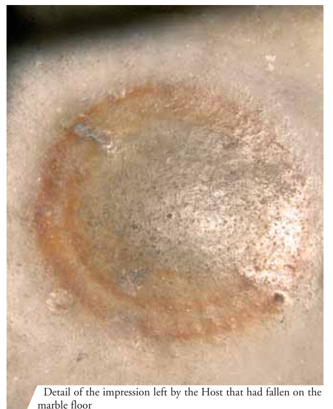
Detail of the impression left by the Host that had fallen on the marble floor

Chapel, constructed by the Caetani family, to this day there is the imprint and the stain of Blood left by a Host which fell from the hands of a priest while celebrating the Mass. The man was overtaken by doubts about the Real Presence of Jesus in consecrated Host, and immediately after the consecration, he inadvertently let the Host fall to the ground, where the imprinted mark is still visible today.