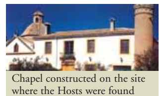
Chapel constructed on the site where the Hosts were found