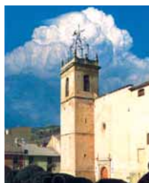
Church of St. James the Apostle in Onil where the miraculous Host is housed