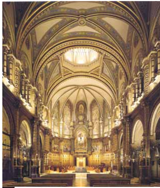
Interior of the church where the miracle took place