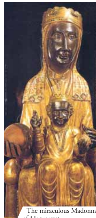
The miraculous Madonna of Montserrat