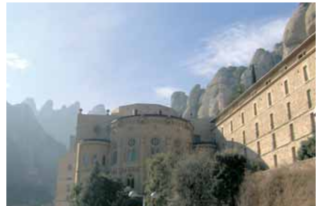
Sanctuary of the Madonna of Montserrat