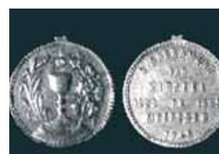
Medals commemorating the miracle