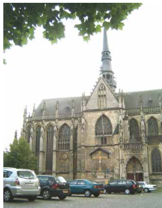
Basilica of the Blessed Sacrament, Meerssen