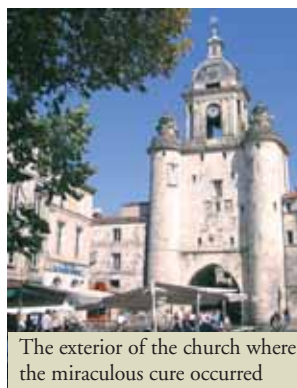
The exterior of the church where the miraculous cure occurred