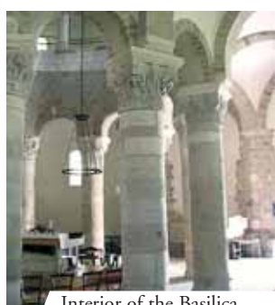
Interior of the Basilica