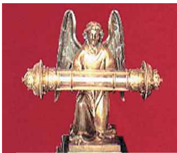
Reliquary of the Precious Blood

There are two drops of Blood from our Lord, Jesus Christ, collected on Calvary during the Passion, preserved in the church of Neuvy-Saint-Sépulcre in Indre. They were brought to France in 1257 by Cardinal Eudes returning from the Holy Land.