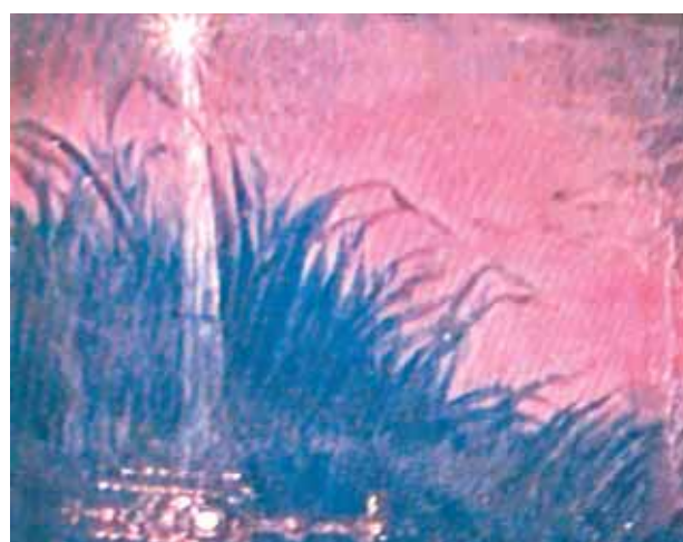
Detail of the painting