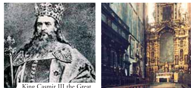
King Casimir III the Great