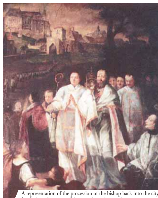
A representation of the procession of the bishop back into the city after finding the Hosts of the miracle in the marsh

spot where the treasure had been abandoned. Bright flashes of light were visible for several kilometers. Frightened villagers approached the area and reported back to the Bishop of Krakow. The bishop called for three days of fasting and prayer. On the third day, he led a procession out to the marsh. There, they found the monstrance, and within it they found the Hosts, which were unbroken and were the source of the unusual lights. The people began to pray and to celebrate the miracle. Annually on the occasion of the feast of Corpus Christi, the miracle is celebrated in the church of Corpus Christi in Krakow.