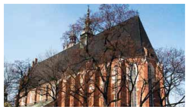
The Corpus Christi Church, Krakow

In the year 1345, King Casimir III the Great of Poland gave orders to build a church named Corpus Christi in honor of the Eucharistic miracle that was verified that same year. It had taken place in the village of Wawel, near Krakow. Some thieves broke into a little church (The Collegiate Church of All Saints), which was a short distance from Krakow. They forced their way into the tabernacle and stole the monstrance, which contained consecrated Hosts.