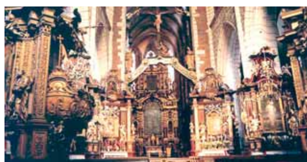
Inside of the Corpus Christi Church, Krakow