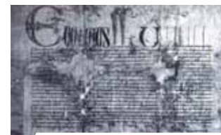
Bull of Eugene IV (1442)