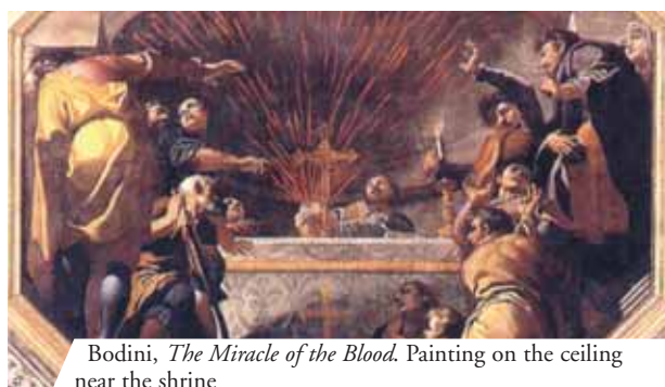
Bodini, The Miracle of the Blood . Painting on the ceiling near the shrine