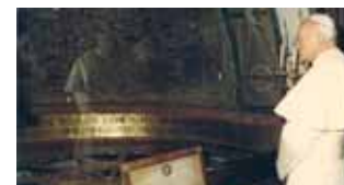
John Paul II pauses before the ceiling vault in Ferrara