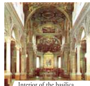
Interior of the basilica