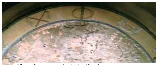
The ceiling crypt stained with Blood