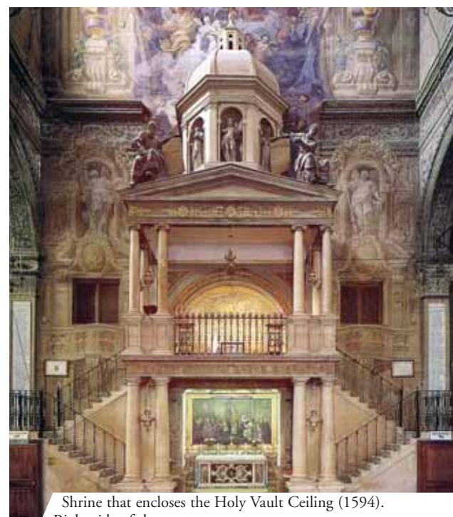
Shrine that encloses the Holy Vault Ceiling (1594). Right side of the cross