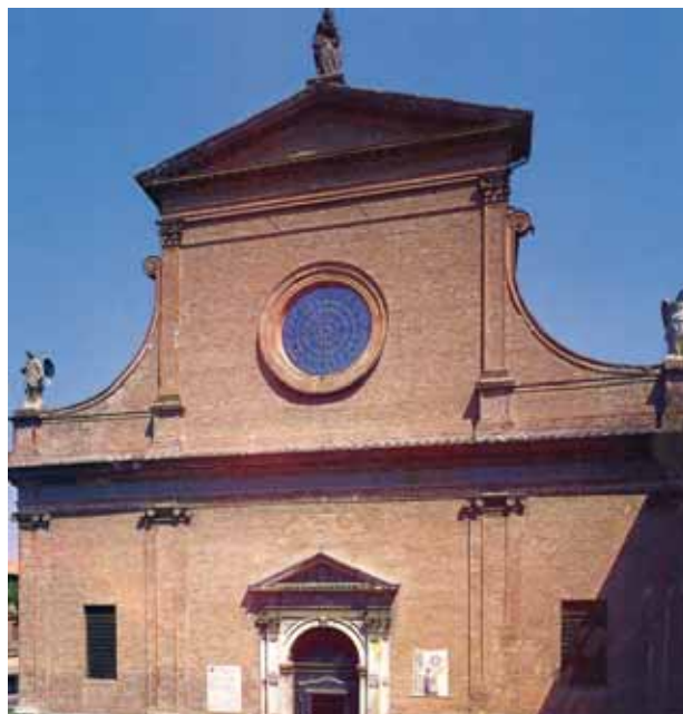
Church of Saint Mary in Vado, Ferrara