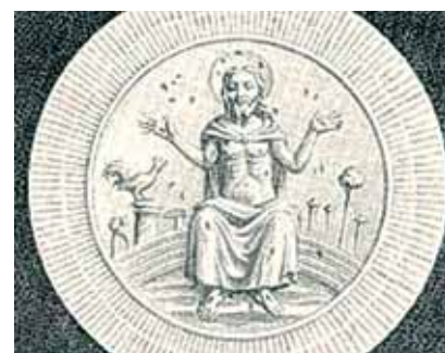
Dijon, Host sent in 1433 by Pope Eugene IV to Phillip the Handsome, Duke of Borgogna

The miraculous Host was burned. Many are the documents and the works of art which illustrate the miracle; for example, one of the stained glass windows of the Cathedral of Dijon in which the main scene of the marvel is portrayed.