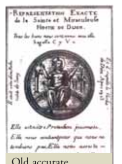
Old accurate reproduction of the Holy Host of the Miracle of Dijon