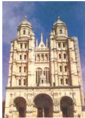
Basilica of St. Michael, Dijon