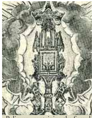
Reliquary containing the Sacred Host, gift of Duchess Isabella in 1454

In the Eucharistic miracle of Dijon, a lady purchased a monstrance which by mistake still contained the Sacred Host. The lady decided to use a knife to remove the Host, from which living Blood began to flow. The Blood dried immediately, leaving imprinted on the Host, the image of the Lord seated on a semicircular throne with some of the instruments of the Passion at His side. The Host remained intact for more than 350 years, until the Host was destroyed by the revolutionaries in 1794.