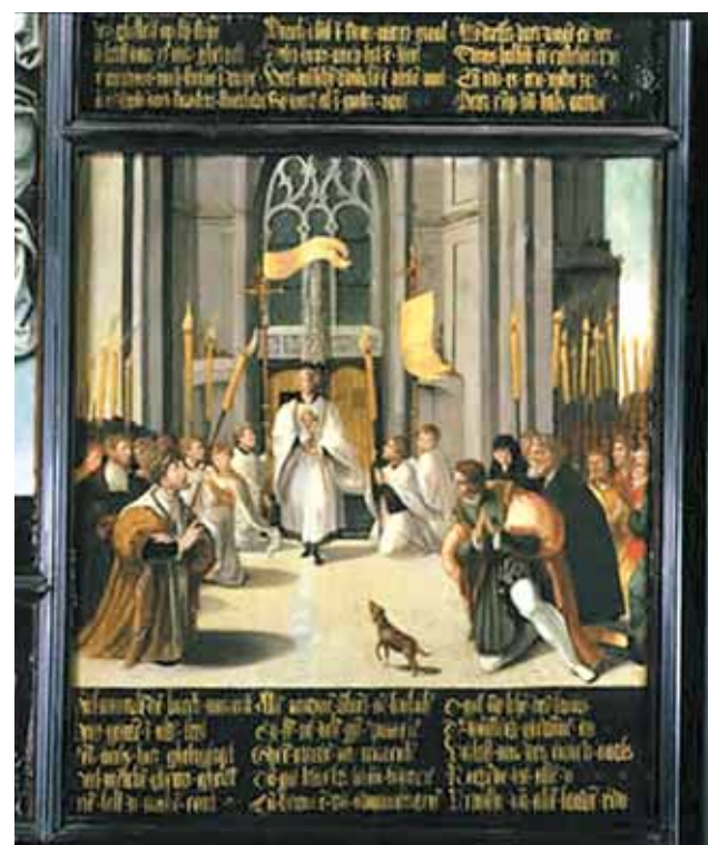
The relic of the miraculous Host is carried in procession (1535), Sacred Museum of Breda

kept alive by the people. After various ups and downs, veneration was solemnly restored in the 20th century by a confraternity in Breda dedicated to the Blessed Sacrament. To this day, processions and public prayers are held each year in honor of the miracle.