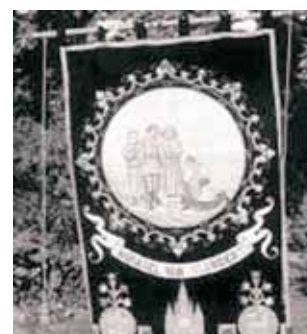
Banner depicting the finding of the miraculous Host