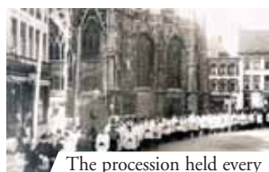
The procession held every year to honor the miracle