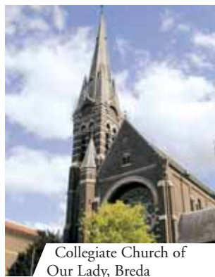
Collegiate Church of Our Lady, Breda