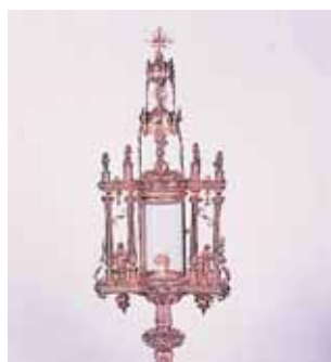
Artistic monstrance in which the miraculous Host is carried, Breda