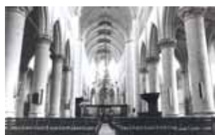
Interior of the church