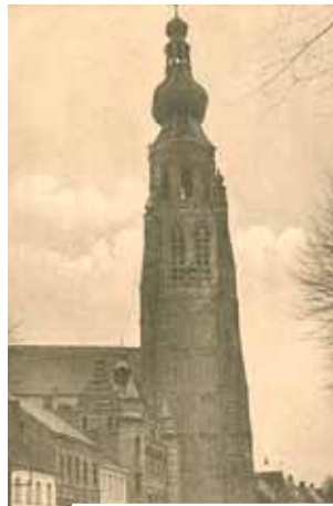
Exterior of St. Catherine's Church, Hoogstraten