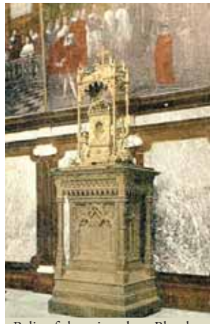
Relic of the miraculous Blood, St. Catherine's Church