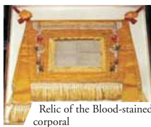
Relic of the Blood-stained corporal