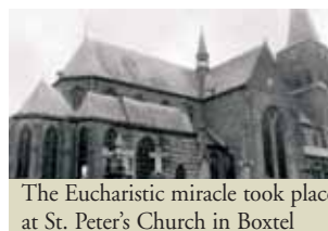
The Eucharistic miracle took place at St. Peter's Church in Boxtel