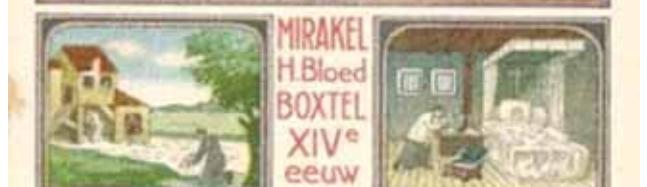
The Eucharistic miracle took place at St. Peter's Church in Boxtel