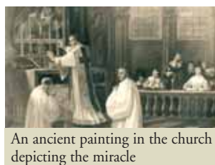
An ancient painting in the church depicting the miracle