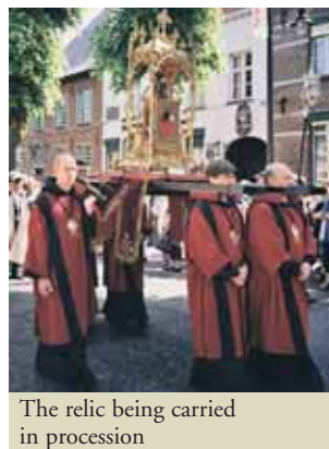
The relic being carried in procession