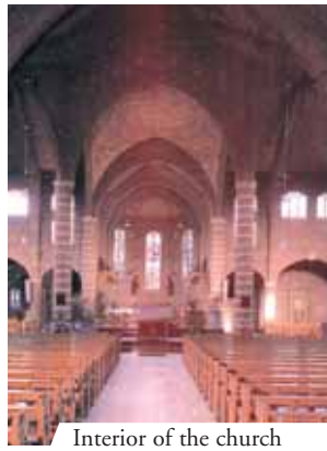
Interior of the church