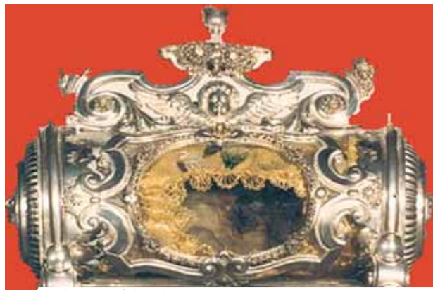
Reliquary of the Blood