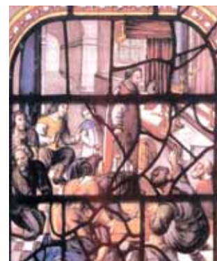
Stained glass inside the church that depicts the miracle