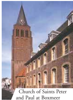
Church of Saints Peter and Paul at Boxmeer

During a Mass in Boxmeer, in Holland, in the year 1400, the species of wine was transformed into Blood and bubbled out of the chalice, splashing onto the corporal. The priest, terrorized at the sight, asked God to forgive his doubts, and the Blood immediately stopped bubbling out of the chalice. The Blood that had fallen on the corporal coagulated into a lump the size of a walnut. Even today one can see the Blood, which has not changed at all over time.