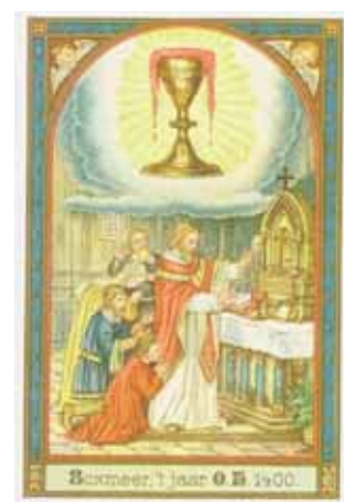
Boxmeer, 7 jaar 05 1900