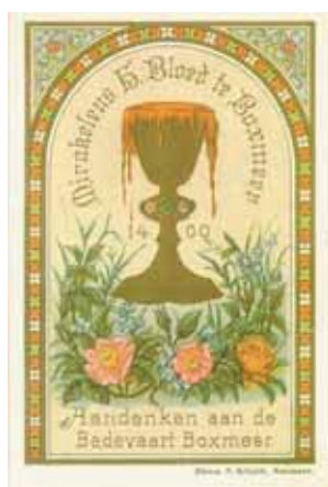
Handenken aan de Bedevaart Boxmeer