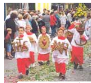
Procession in honor of the miracle

tablets and paintings. Popes Clement XI, Benedict XIV, Pius IX and Leo XIII all showed a particular devotion to the miracle.