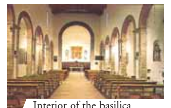
Interior of the basilica