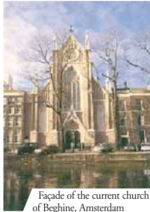
Façade of the current church of Beghine, Amsterdam

In 1452 the chapel was destroyed by a fire, but strangely the monstrance containing the miraculous Host remained intact.