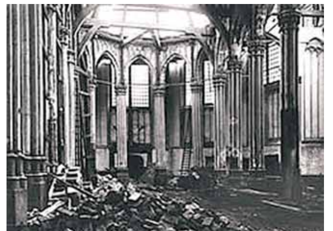
The chapel of the church was destroyed again in 1908