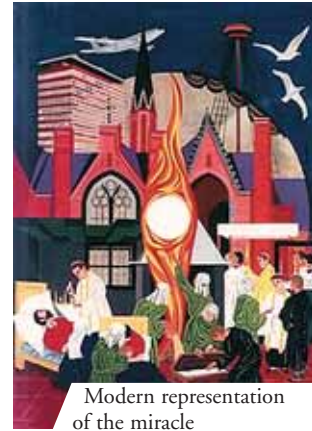
Modern representation of the miracle