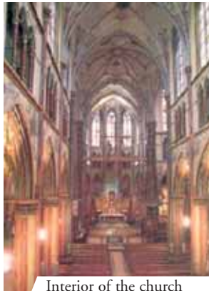
Interior of the church