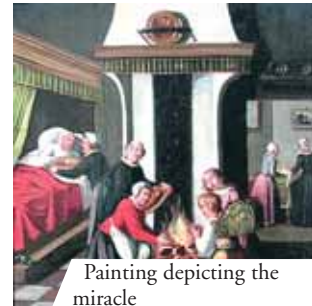
Painting depicting the miracle