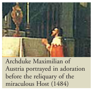
Archduke Maximilian of Austria portrayed in adoration before the reliquary of the miraculous Host (1484)