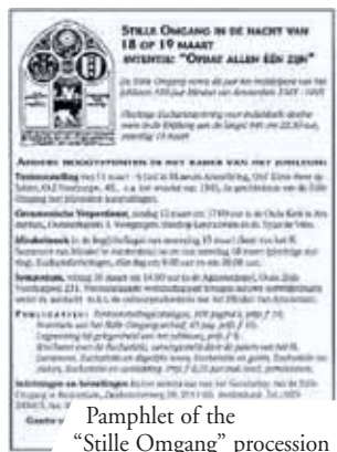
Pamphlet of the "Stille Omgang" procession