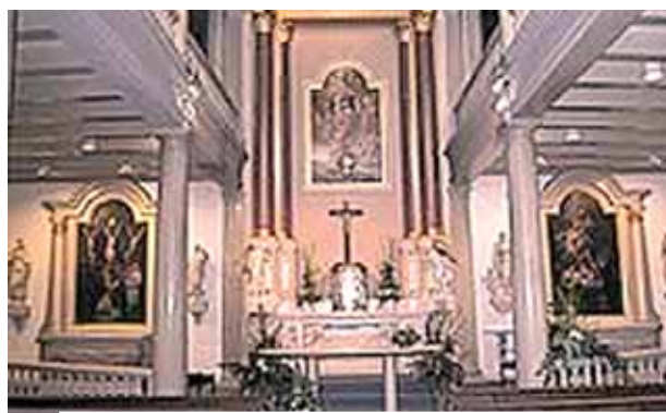
Chapel of the Blessed Sacrament