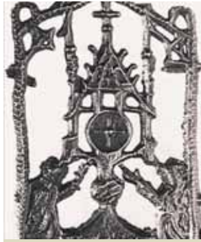
Sculpture of the ancient monstrance which contained the miraculous Host