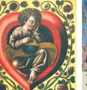
The Child Jesus is pictured in an iconograph in the style of the Spanish Counter Reformation, atop a globe of the earth studded with stars of gold. The Child holds His Heart in His hand. From the collection of the Hieron Museum in Paray-le-Monial