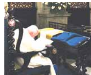
In the year 2000, Pope John Paul II decreed that on the first Sunday after Easter, the Liturgical Feast of Divine Mercy is to be celebrated