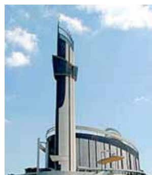
Shrine of the Divine Mercy, Cracow