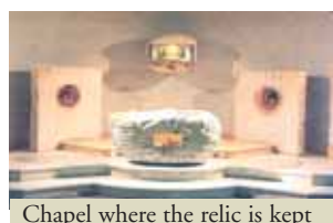
Chapel where the relic is kept in the Lower Basilica