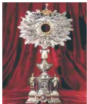
Ancient monstrance which contained the relic of the miracle