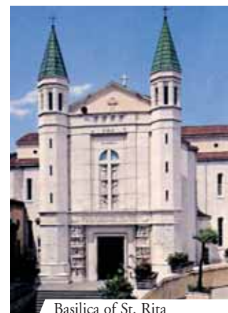
Basilica of St. Rita