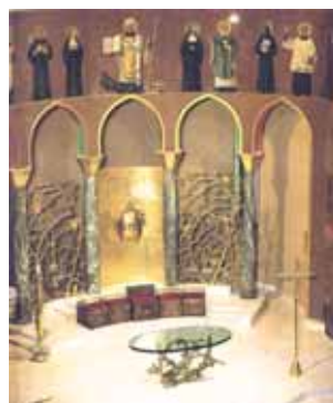
Upper Basilica with presbytery by the sculptor Manzù