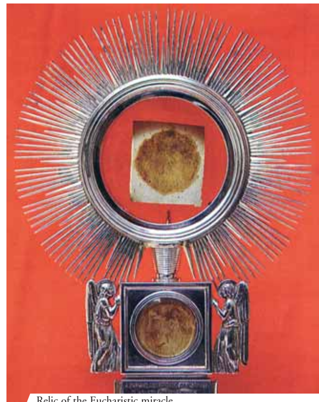
Relic of the Eucharistic miracle