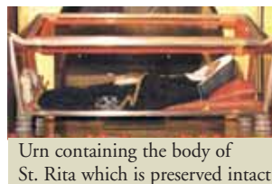
Urn containing the body of St. Rita which is preserved intact