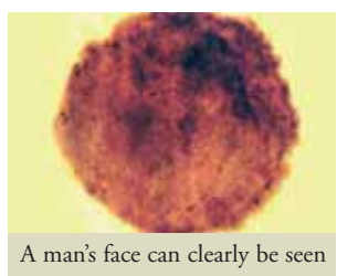
A man's face can clearly be seen