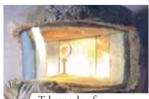
Tabernacle of the Eucharistic miracle